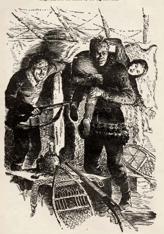
"The spirit of the bottles had made me weak like a newborn child. My legs would no more stand under me. Then he took Unga in his great arms and carried her off, and his laugh was like the sound of the big bull seal."