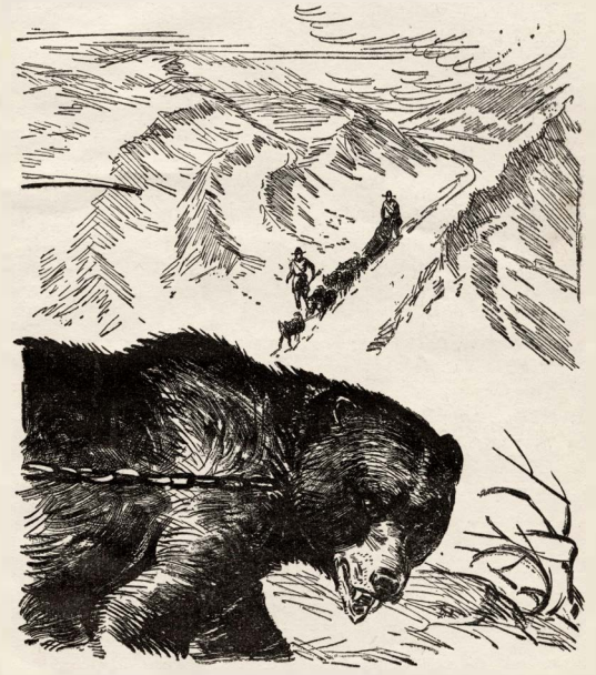
Cunning as the lynx-cat. Fierce as the wolverene, she stalked the land of the wild exile... alluring, savage, beauteous bait for the stanch Red Coat breed who sought the mystery of Man-Trap Valley.